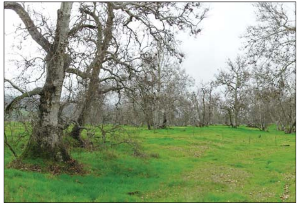
Sequoia Riverlands Trust is working to open Dry Creek Preserve, pictured above, to the public.

"Little kids are great," he laughed, "especially when you're the leader of something. They're hard workers and they love to be outside. You let them climb a tree when they're done, and it was the greatest day for them. It teaches them to work with their hands and do something for someone else."