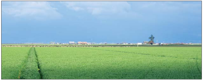
A Tulare County family farm provides crops, open space and wildlife habitat.

The Sequoia Riverlands Trust (SRT) is a local, community-based, 501 (c)(3) non-profit conserving the natural and agricultural legacy of the southern Sierra Nevada and San Joaquin Valley. A copy of the latest financial statement and registration filed with the Registry of Charitable Trusts may be obtained by contacting the SRT office. Contributions are deductible to the extent allowed by law.