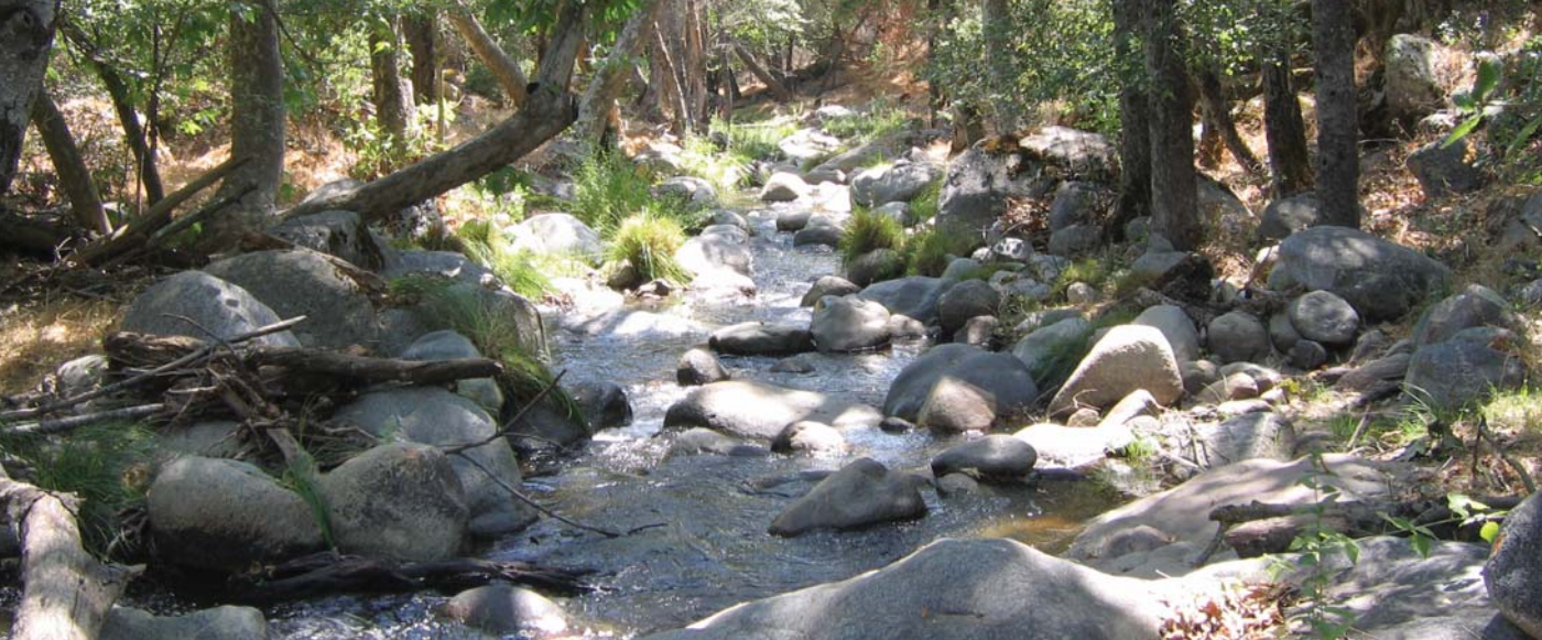
Buckeye Ranch contains crucial plant and wildlife habitat along Tyler Creek, a significant tributary of Deer Creek.