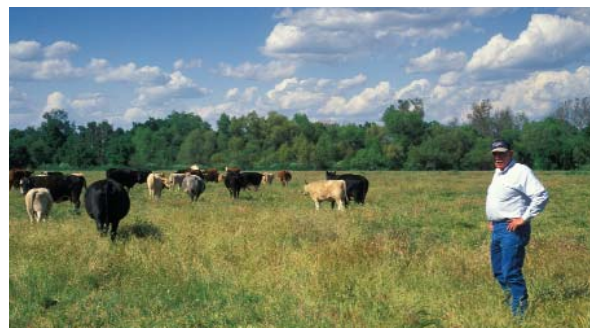
Ed Carroll keeps a watchful eye over his grazing livestock at Kaweah Oaks Preserve.